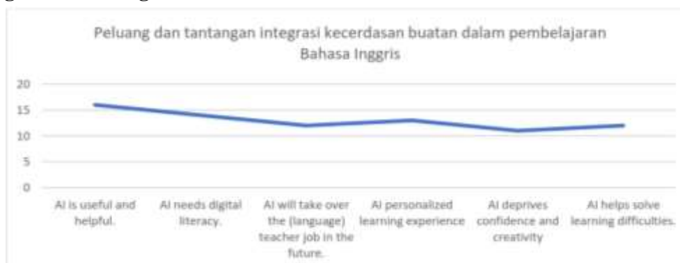
Figure 3. Opportunities and challenges of integrating artificial intelligence into Language teaching and learning

Based on Figure 3 above, the integration of artificial intelligence (AI) in English language teaching at UIN Alauddin Makassar creates opportunities and challenges. Artificial intelligence (AI) is very useful in English language learning and teaching. AI applications that continue to emerge create opportunities for teachers, lecturers and students to gain unlimited knowledge. Apart from that, AI can also help solve difficulties in learning languages instantly. Artificial Intelligence may play the function of a tutor. Students can talk about issues they've run into or suggestions they have for finishing the task. In the end, ChatGPT functions as a sophisticated rubber duck (Malinka et al., 2023) that aids professionals and students in resolving issues that arise. Chatbots with artificial intelligence have the potential to expedite the acquisition of new technologies by students. Since the chatbot may better explain the underlying concepts or provide sample in addition to the official documentation, well-prepared queries improve the effectiveness of the learning process. This also holds true for learning more about subjects that the student is not familiar with.