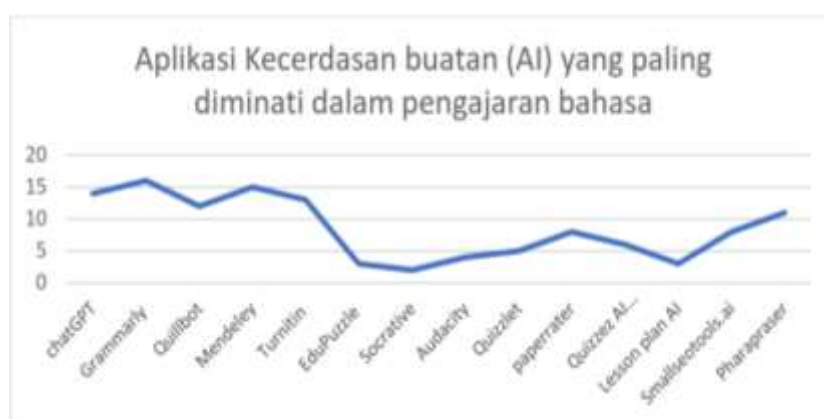
Figure 1. Artificial intelligence (AI) is most often used to facilitate English language teaching and learning

In the survey, lecturers were asked to list at least five artificial intelligence (AI) applications that are often used in language teaching and learning. The five most frequently used artificial intelligences to facilitate language teaching are presented in Figure 1. Overall, Grammarly was most frequently used to check student work for grammatical errors, with about 13 English lecturers choosing this app.